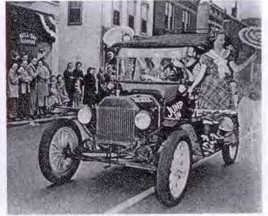
At the recent centennial celebrated by the city of Dayton, Ky., the Wadsworth Watch Case Company displayed the float at left. No parade or celebration is complete without its clowns and, from the looks of the center photo, Dayton had its share. Riding in and on an antiquated model automobile, club women of Dayton impersonated bathing beauties of 1898, the year the Dayton Bathing Beach was opened on the Ohio River. The three-day celebration attracted more than 50,000 persons.