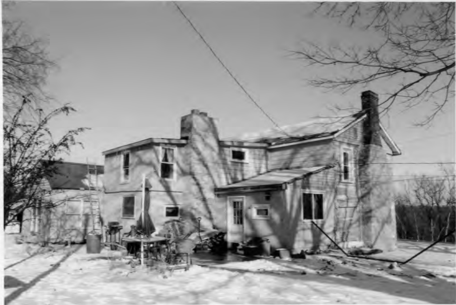
J. Q. A. Stephens House, Boone Co. KY 2