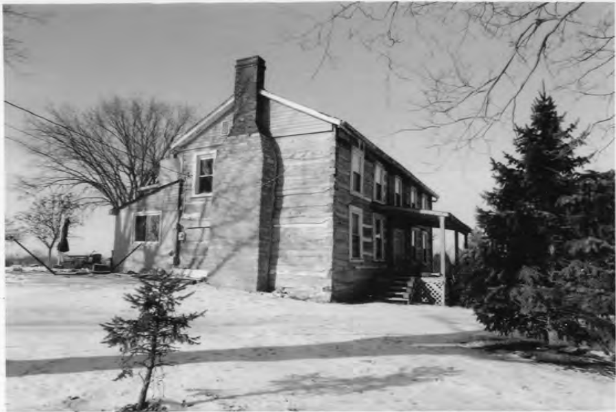
J. P. A. Stephens House, Boone Co. KY