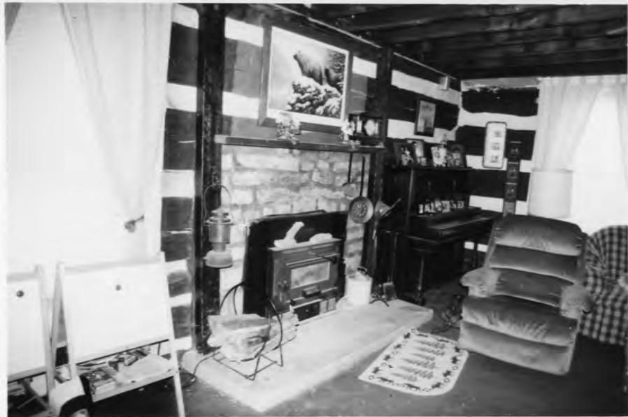
J. Q. A. Stephens House, Boone Co., KY 5