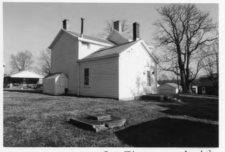
House Bunlinston 3