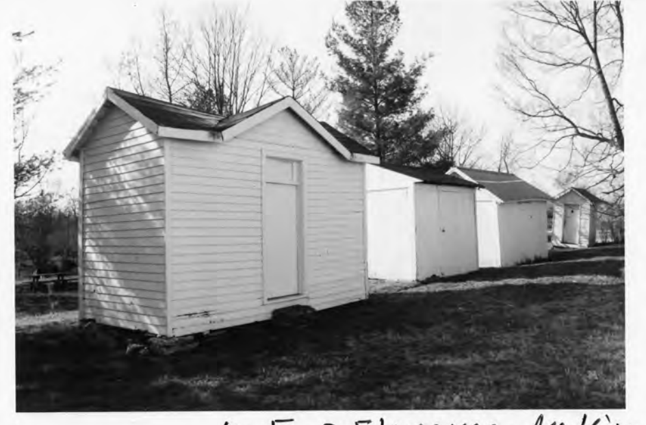
W.F. & Florence Mekim House, Bun linston, 4 Boone Co., KY