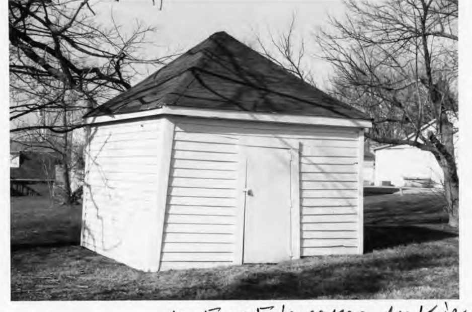
House, Burlington, 6