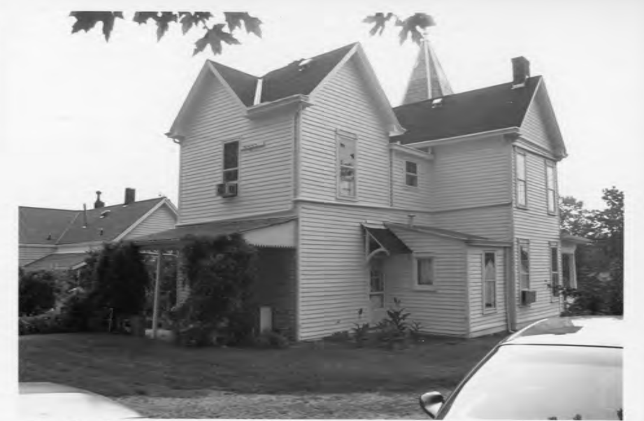
Metalfe Stephens House