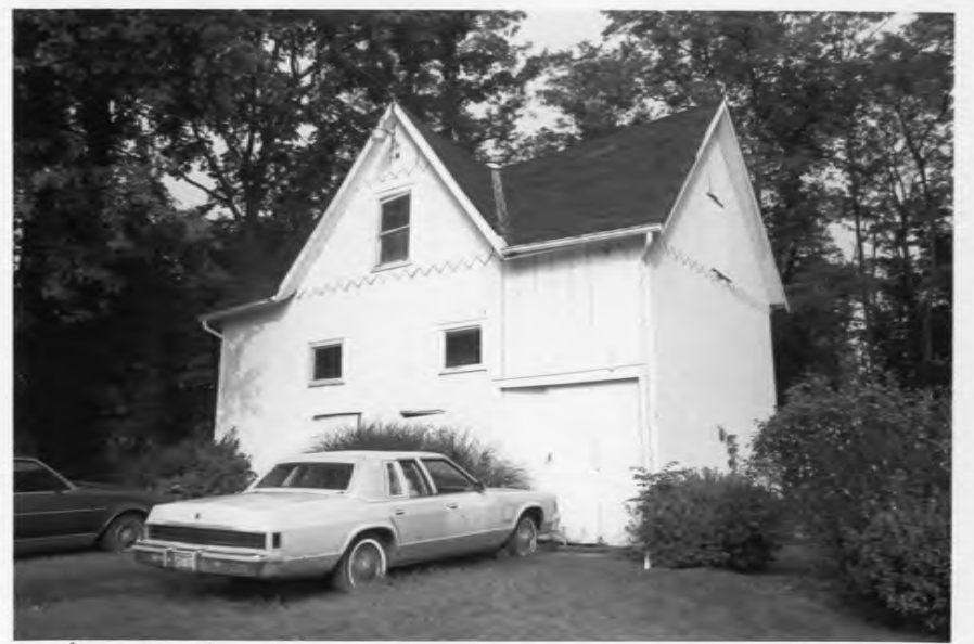
Metcalfe-Stephens House Kenton Co. Ky Photo 5