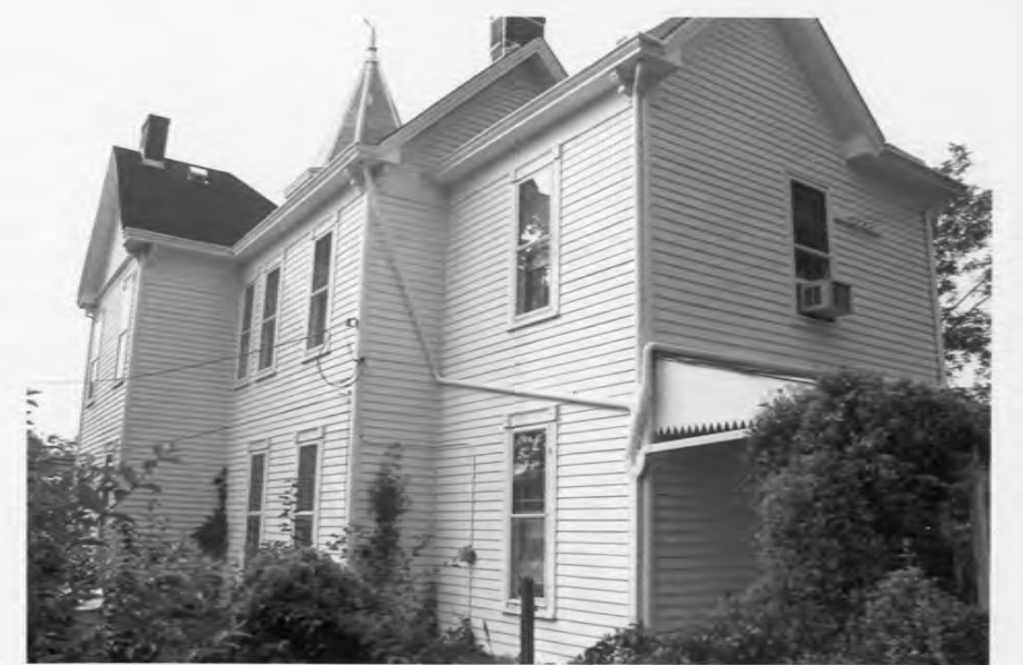
Metcalfe Stephens House