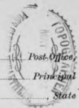
Diagram showing the site of the _____ Post Office, in Township _____ (N. or S.), Range _____ (E. or W.) of _____ Principal Meridian, County of Carroll , State of Kentucky , with the adjacent Townships and Post Offices.

It is requested that the exact site of the proposed or existing Post Office, as also the roads to the adjoining offices, and the larger streams or rivers, be marked on this diagram, to be returned as soon as possible to the Post Office Department.