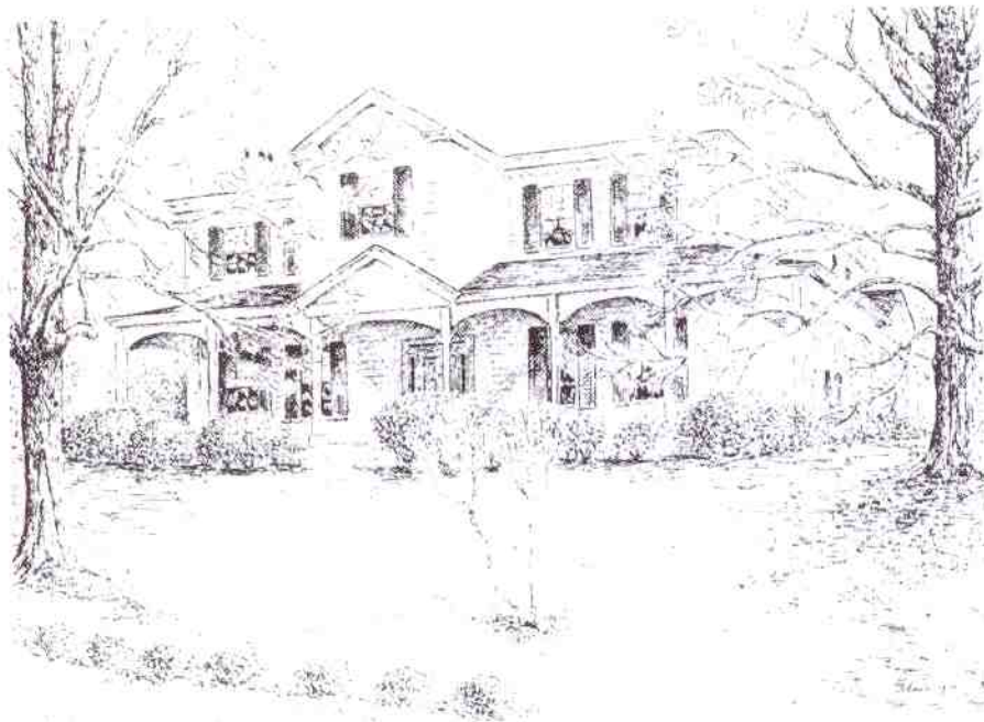
Taliaferro Home First Church - 1830