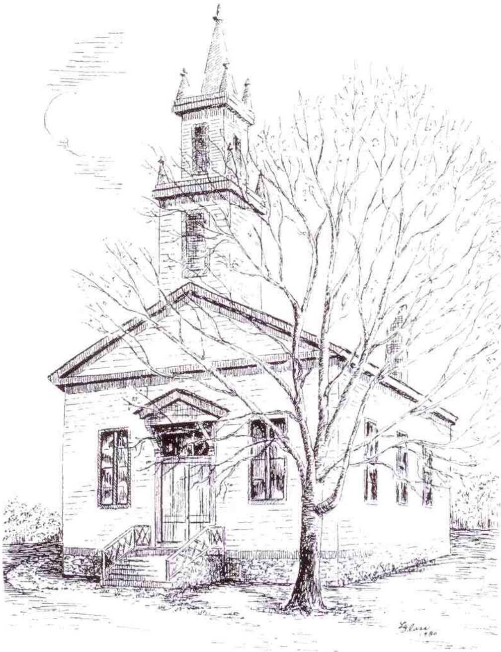
Mt. Pleasant Methodist Church Circa 1850 - 1900