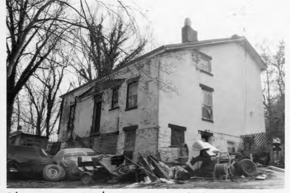
House, constance, Boone