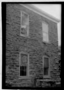
detail of stone front elevation