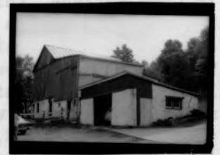
bank barn and garage