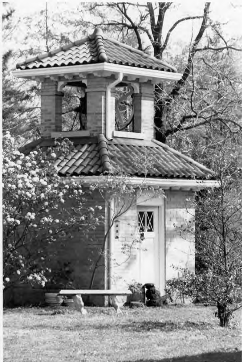
Fort Mitchell, KY M.A.S. Photo 3 Highland Cemetery Historic District