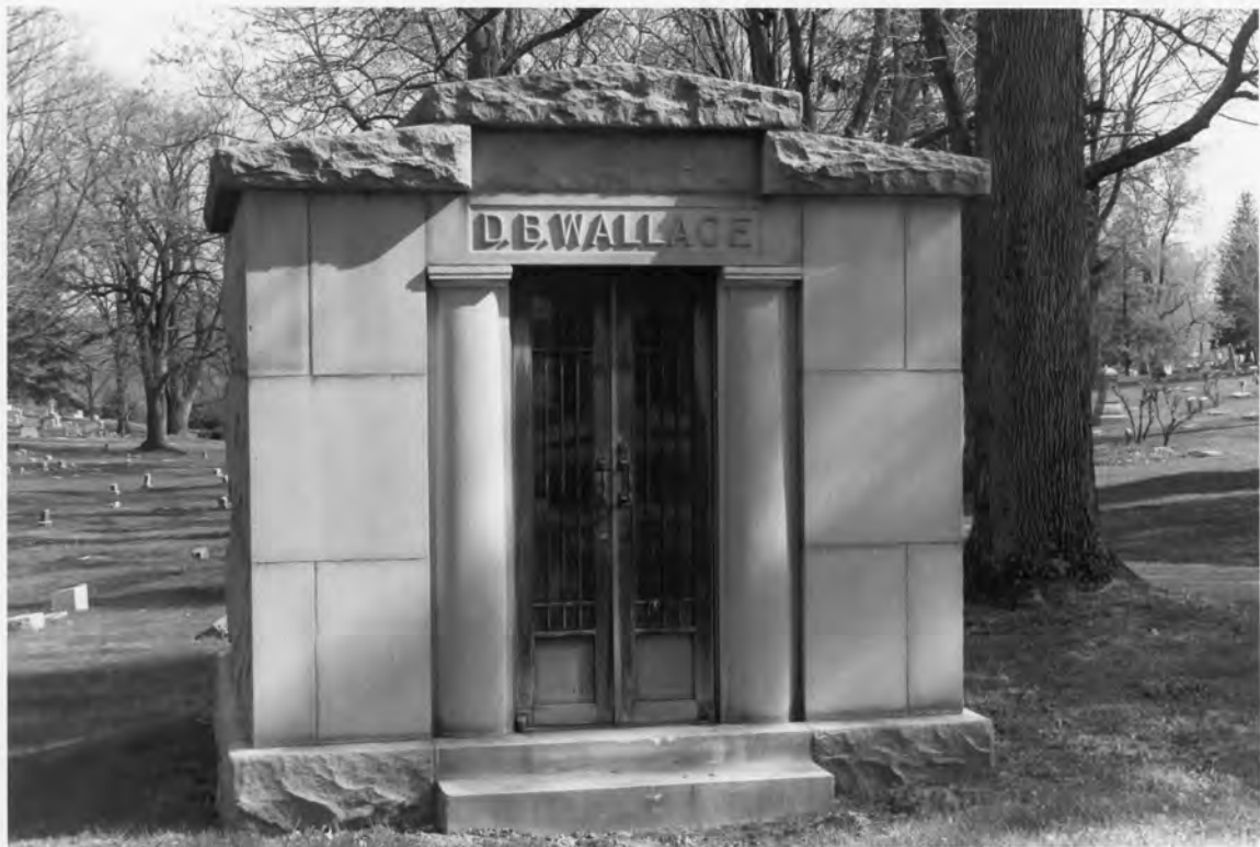
Fort Mitchell, KY M.P.S. Highland Cemetery Historic District