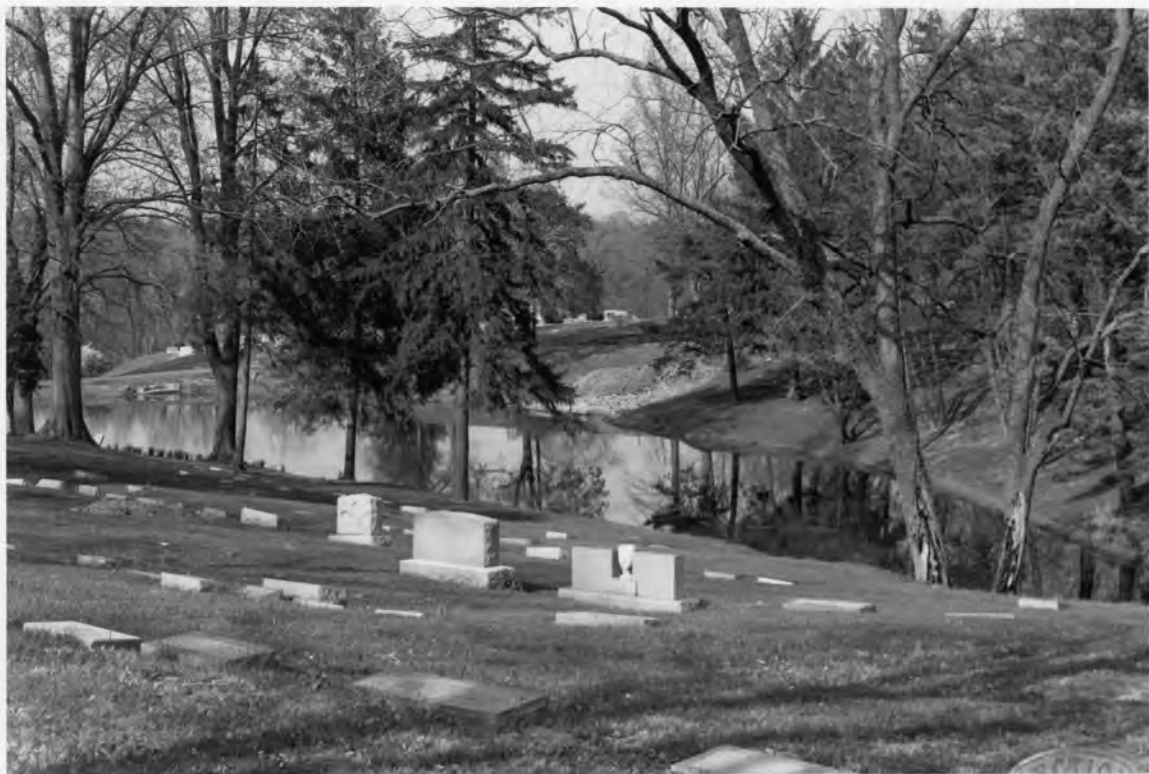
Fort Mitchell, KY M.P.S. Nishland Cemetery Historic District