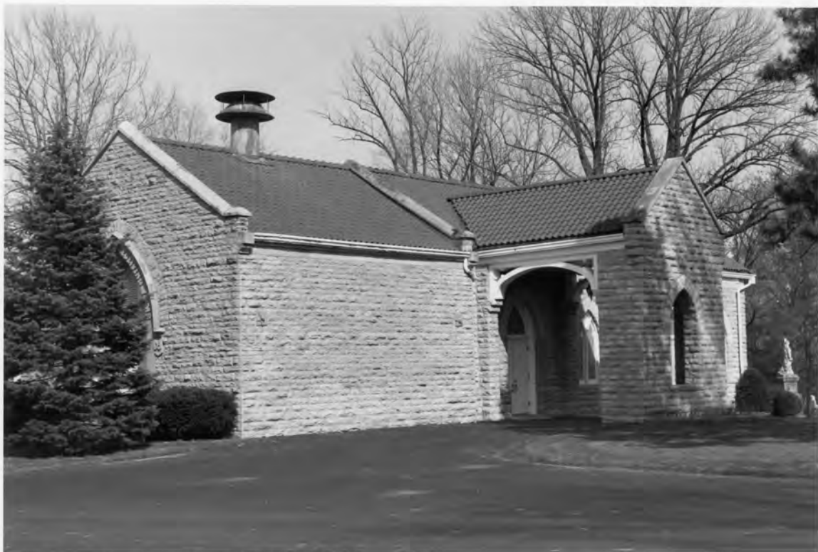
Fort Mitchell, KY M.R.S. Highland Cemetery Historic District