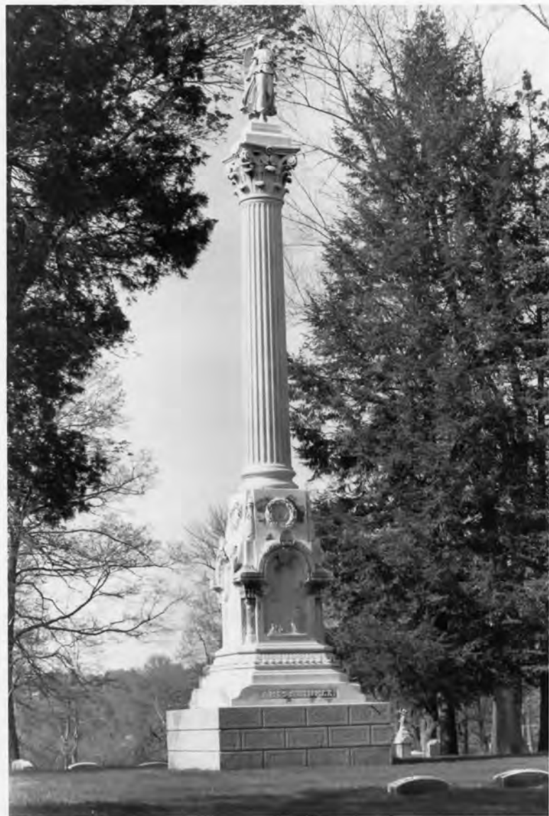
Fort Mitchell, KY M.P.S. Photo 7 Highland Cemetery Historic District