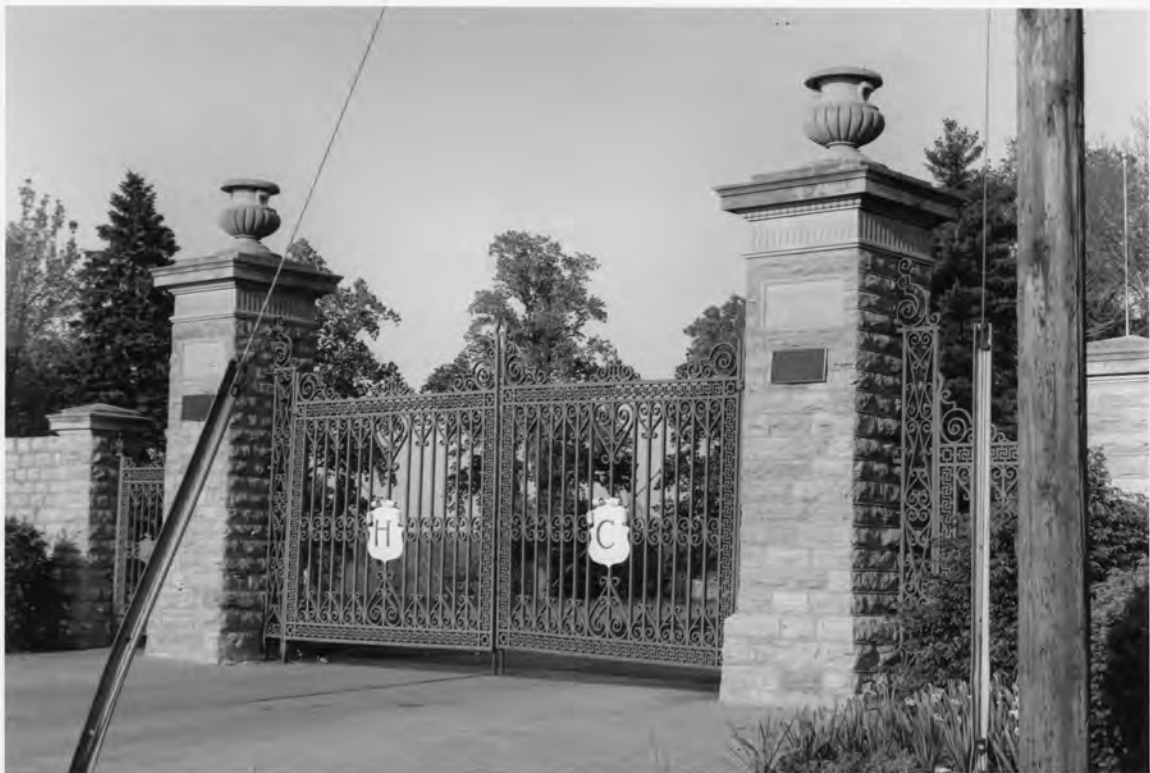
Fort Mitchell, KY M.P.S. Highland Cemetery Historic District