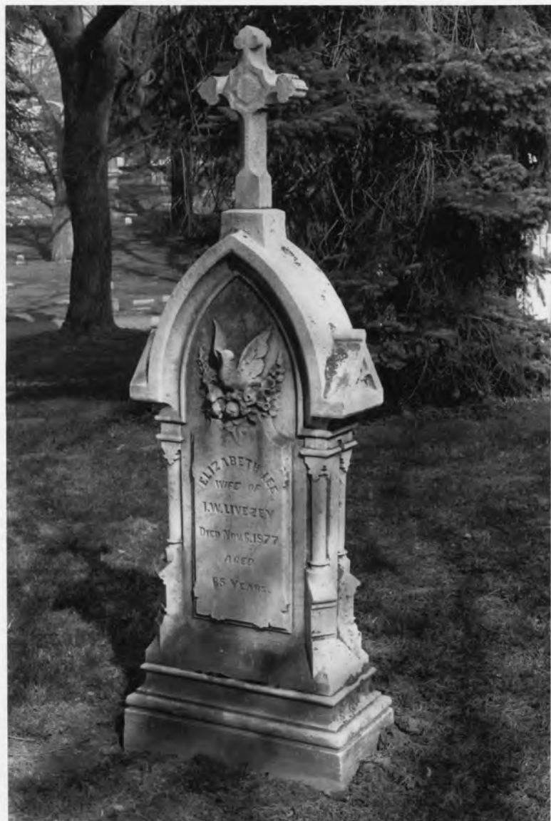
Fort Mitchell, KY M. P. S. Photo 8 Highland Cemetery Historic District