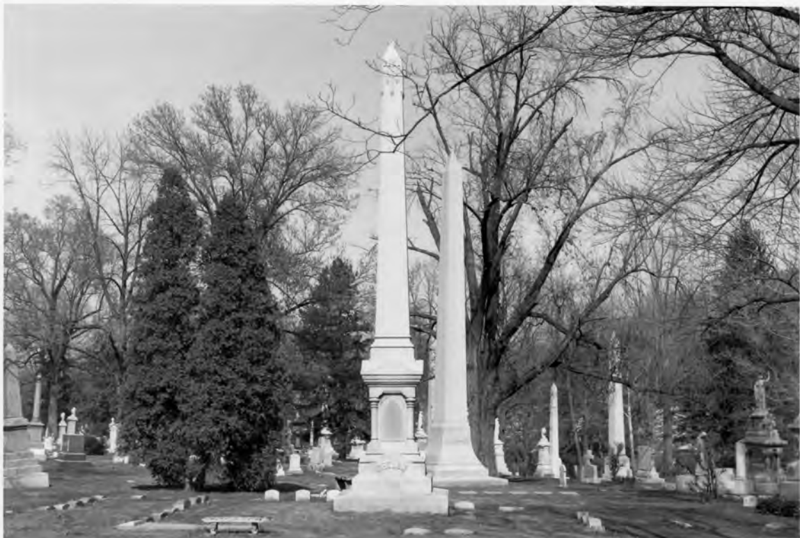
Fort Mitchell, KY N.P.S. Highland Cemetery Historic District