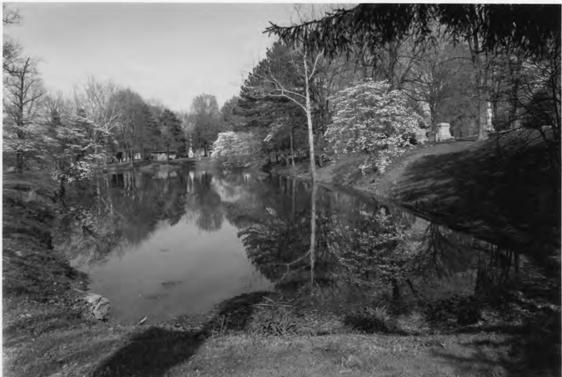
Fort Mitchell, KY M.P.S. Highland Cemetery Historic District