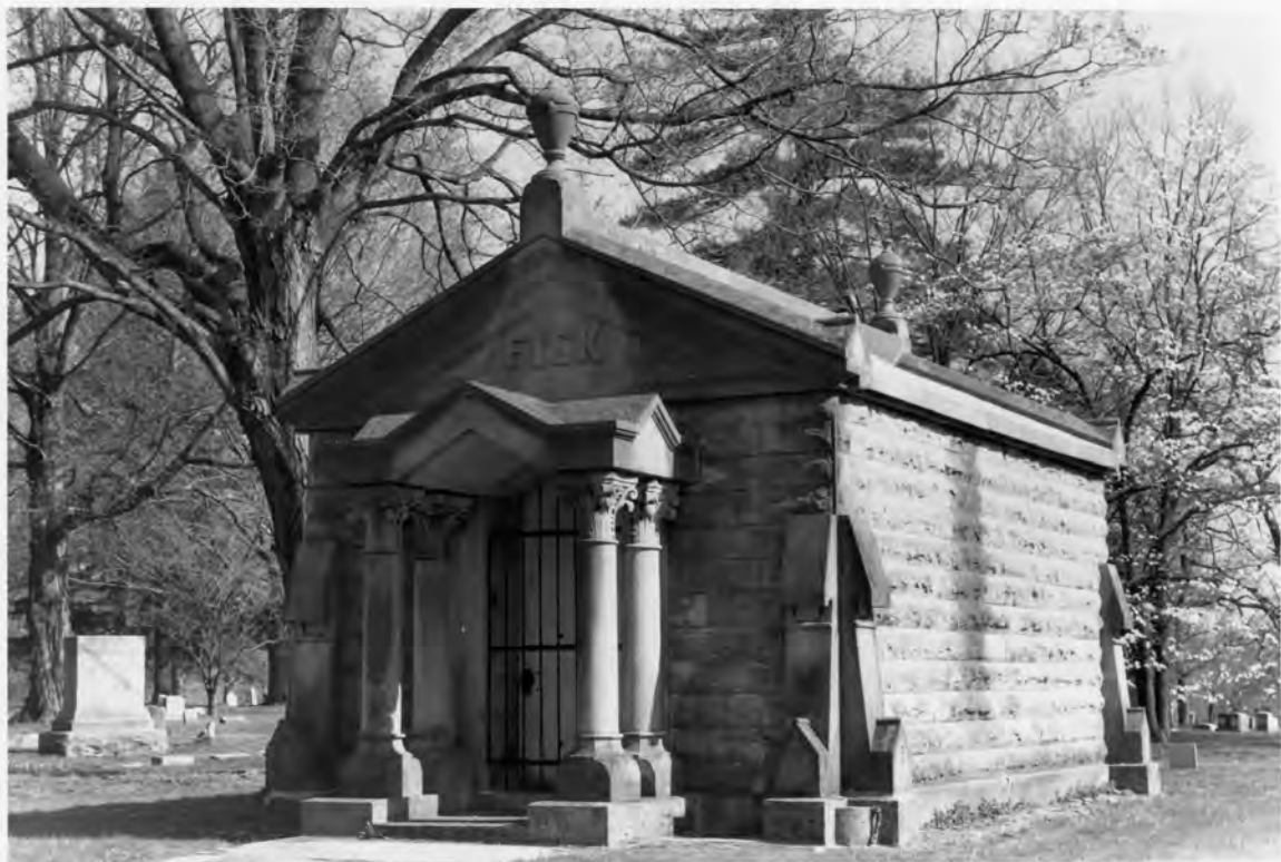
Fort Mitchell, KY U.P.S. Highland Cemetery Historic District