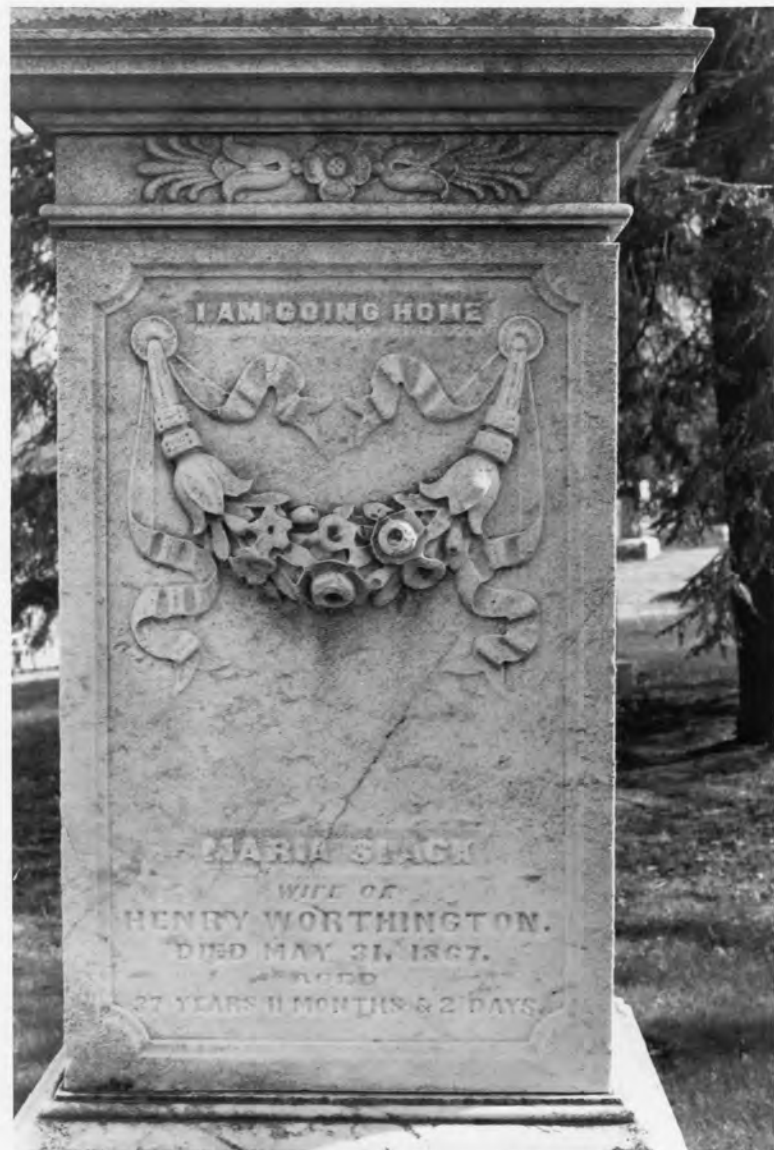
Fort Mitchell, KY M.P.S. Photo 9 Highland Cemetery Historic District