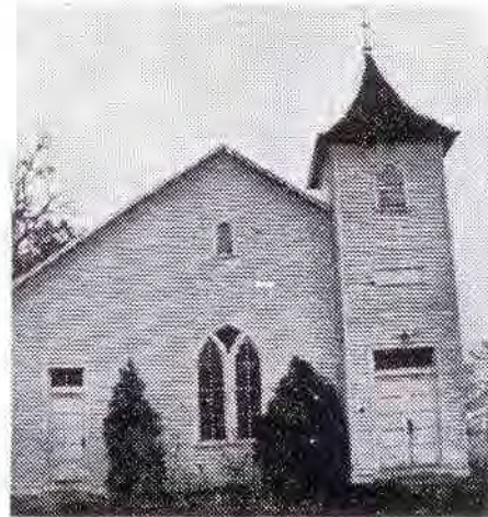
MUSSEL SHOALS BAPTIST