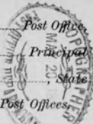
Diagram showing the site of the _____ in Township _____ (N. or S.), Range _____ (E. or W.) of _____ Meridian, County of _____ of _____, with the adjacent Townships and Post Offices _____